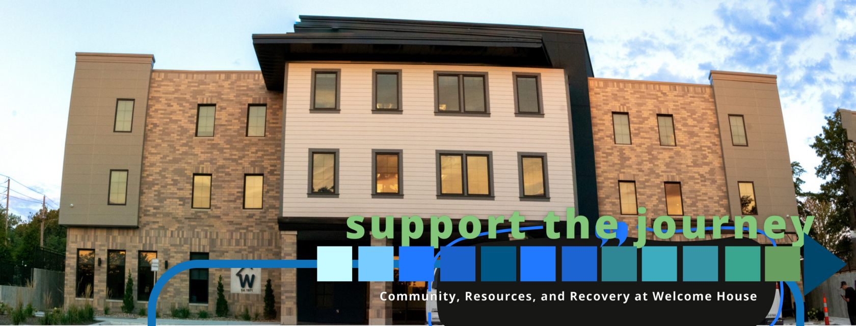
Pictured above: Opened to residents and staff on July 31, 2023, the new Welcome House Recovery Center.

The Recovery for Life Capital Campaign is a lasting testament to the mission of addiction recovery, saving lives, and reuniting families. Your support is an investment to change a family tree for a healthier and safer community.